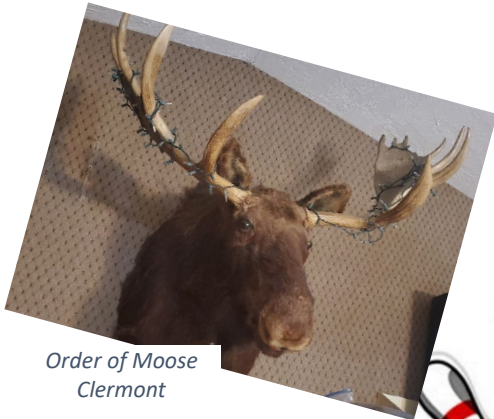
Order of Moose Clermont